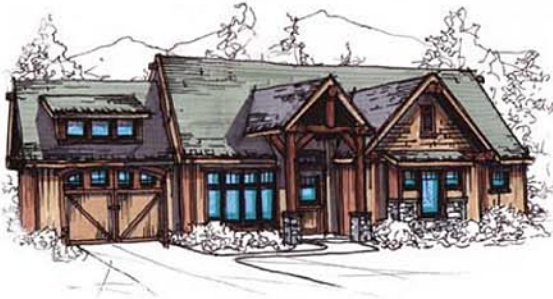
3/2 - Timber Framing - Vaulted ceilings - Plenty of room to enlarge the square footage or add special features. Designed specifically for a cottage lot at Porter Creek. $294,000 Land/Home Package.